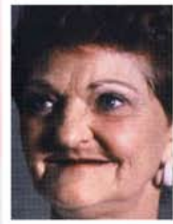
Fig. 1 Before