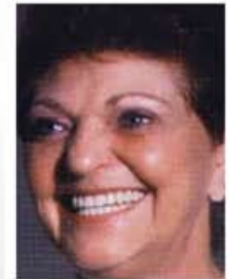
Fig. 2 After

ALVELAC™ Socket Preservation, The Natural Way